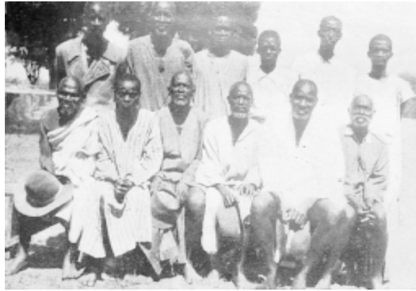
PHOTO 1

two represent a group of local authorities, senior men wearing long shirts of Muslim inspiration, barefoot, their hats in their hands, assembled as a school group (see photos 1 and 2), and are accompanied by the following title: “Population chiefs, ‘Nagák’ and ‘Namuã’ [local titles] of some of the territories of the area of the posto , photographed during the meetings for the administration of the ethnographic questionnaire.”