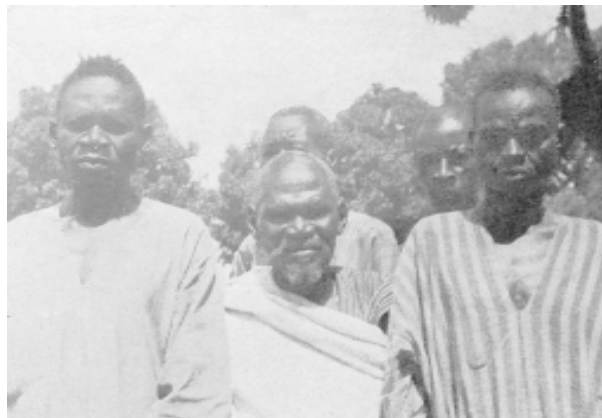
PHOTO 2

The third picture represents the régulos of Costa de Baixo and Pandim, photographed from a low angle ( contre-plongée ) to emphasize their importance, wearing Western civil suits (see photo 3). The last picture, the only that was not taken in the District capital, portrays a régulo of Pecixe in institutional clothes, including a hat over a scarf, “band cloths” that cross his shoulder, an enormous earring, a collar of the initiates (see photo 4).