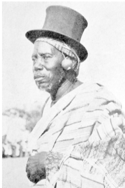
PHOTO 4

From the unidentified group in the first photos to the three identified régulos of the last set there is a shift which elucidates how the colonial administration regarded the representatives of the local power and valued those sovereigns as preferential partners. Even if different local personalities