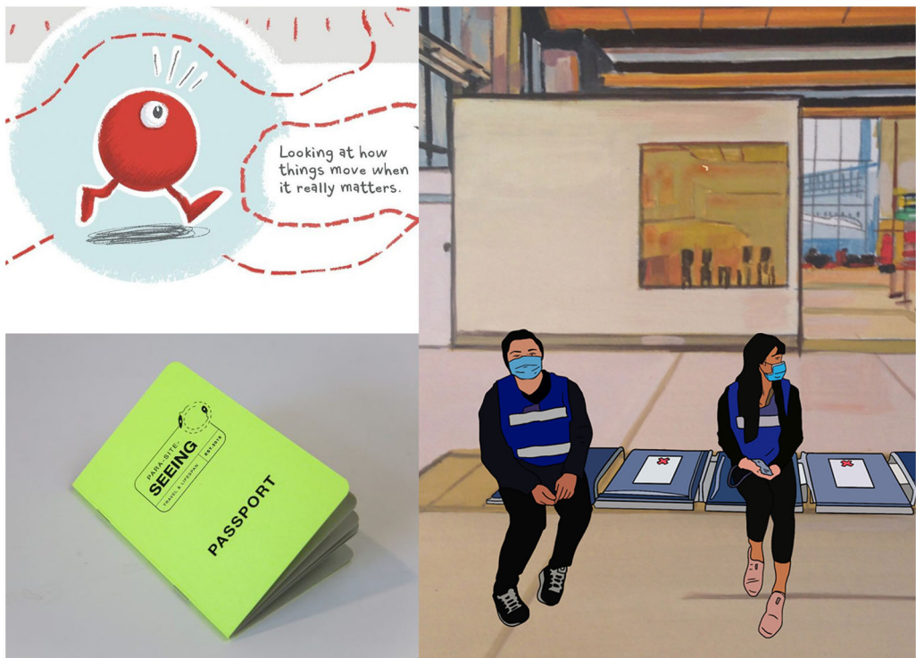
Figure 3. Close up of Blood Journey , by Stephanie Sodero (top left); Para-Site-Seeing by Rod Dillon and Southern (bottom left); Pandemic Airport , by Clare Booker (right).

2012). Through expertly staged events visual and theatrical methods enable connections to be made, and discussion to flow around emerging and often invisible or unspoken im/mobilities.