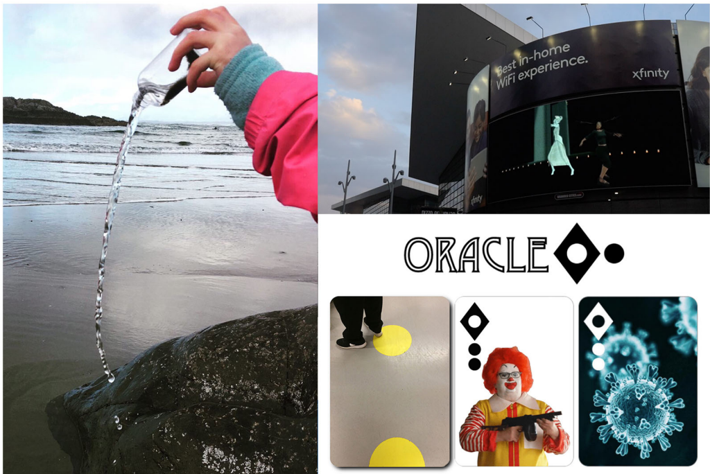
Figure 8. Screenshot of S Project , by Gudrun Filipka and Carly Butler (left); out of isolation came forth light , by Tess Baxter (top right); Oracle , by Heidi Wood (lower right).

mobile equipment with an array of recording and sound manipulation options, allows for sampling of natural soundscapes and rapid music and video creation in natural settings.