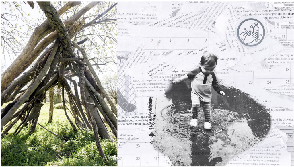
Figure 5. Screenshot of Penumbra , by Nick Ferguson (left); close up of Collages from confinement , by Aryana Soliz (right).