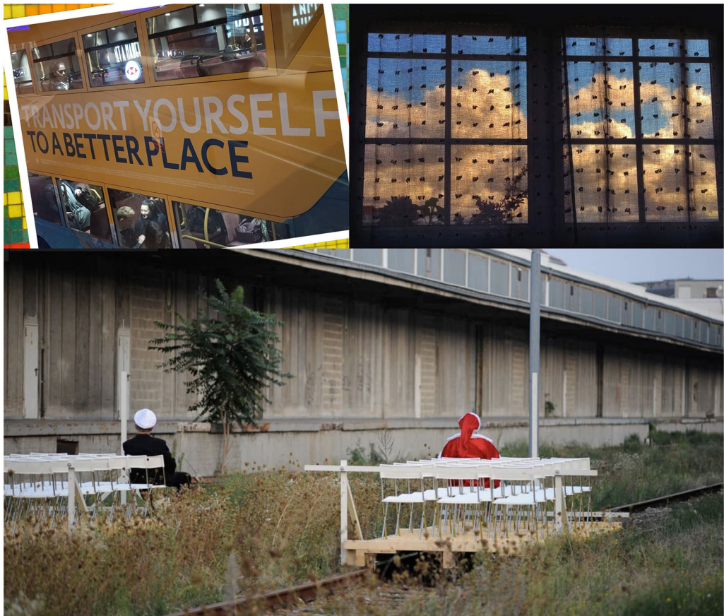
Figure 2. Close up of Transport Yourself to a Better Place , by Janet Bowstead (top left); Quarantine notebook , by Catarina Sales Oliveira (top right); screenshot of Nordwestpassage , by Michael Hieslmair and Michael Zinganel (lower).

a women's centre with women who were beginning to resettle. Over weekly sessions, participants used their photography and captions to communicate their experiences of mobility, producing images, maps and collages for themselves, for the group, for display in women's services, and for wider presentation through the research. The sessions built confidence in both creativity and in sharing their insights, with the concern to make safely visible their isolated and hidden journeys. Women explored their experiences of displacement and resettlement, and brought their individual images together into collages to show their collaboration. Whilst recognising what they had lost, women also focused on what they could take with them, and on sharing messages of strength and hope to reach other women they imagined making similar forced journeys.