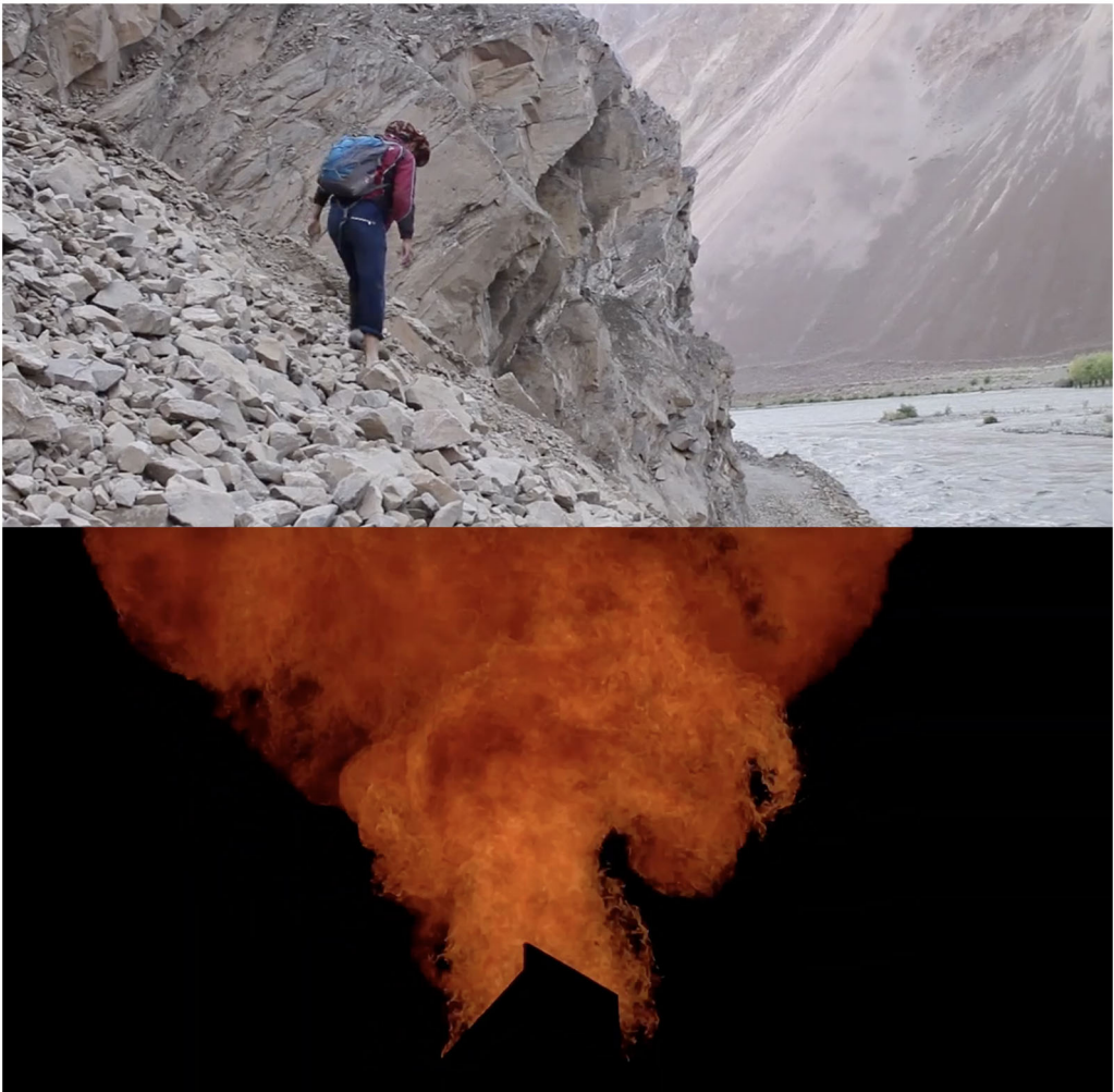
Figure 6. Screenshot of On the Bartang roads , by Suzy Blondin (top); Earth , by Max Schleser and Martin K Koszolko (bottom).

neighbourhoods made strange by the times. As an artist who explores transport infrastructure, and whose professional trajectory is bound up with my own mobility, I wanted to witness the confrontation between the vectors of global mobility and those of its coronavirus counterpoint, and to find early signs of how my status as an artist was being reconfigured.