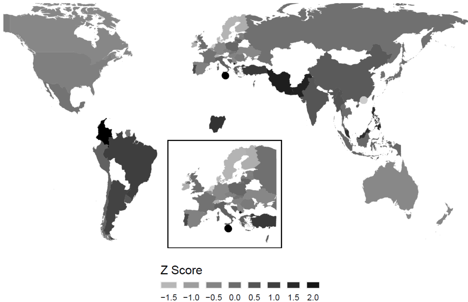
Figure 2. Geographic Distribution of Aggregate Negative Affectivity Scores. Darker shading represents higher scores. Data not available for countries in white.