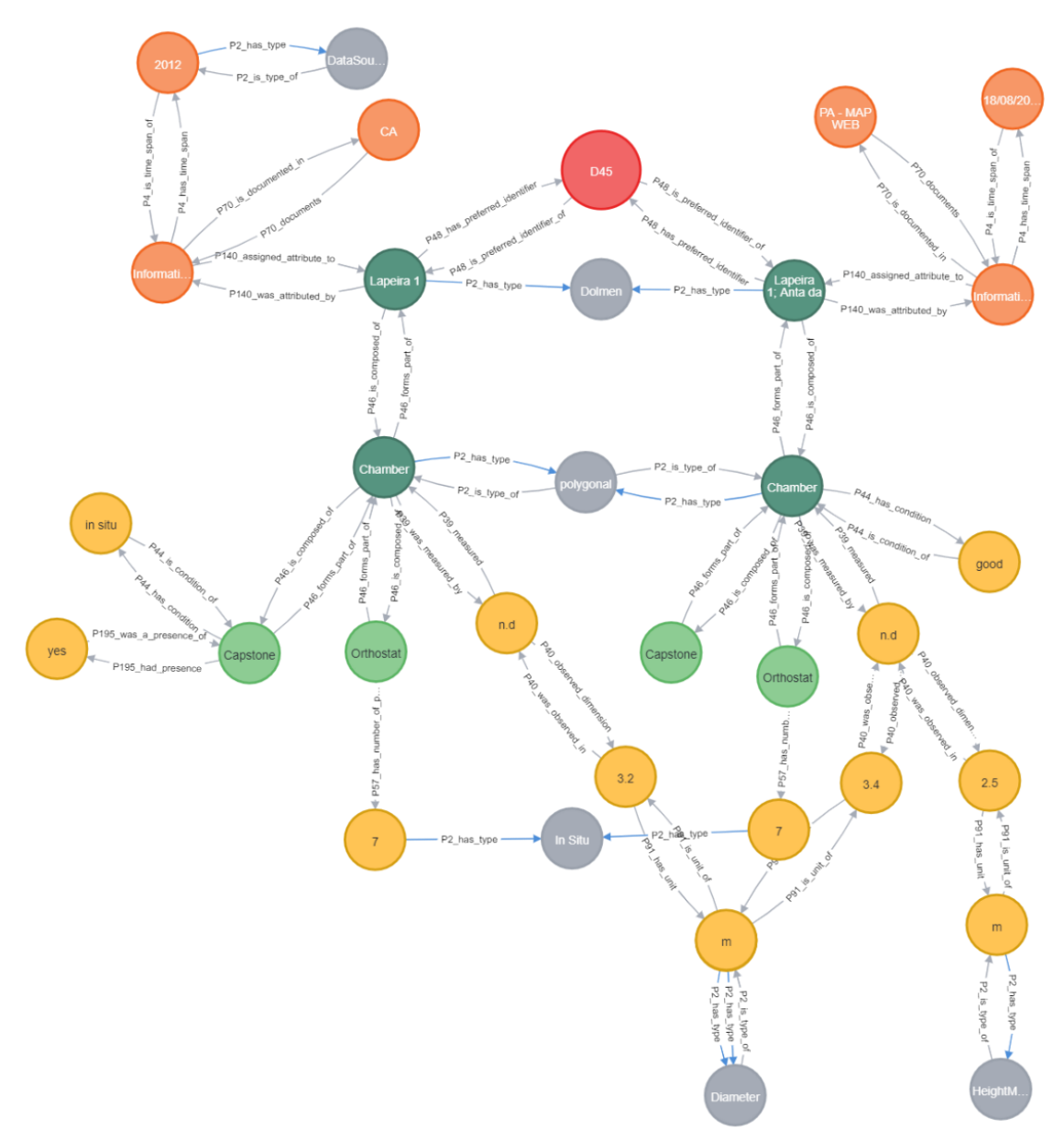
Figure 4: Here, we can visualise information about the same monument (Lapeira 1) based on two different sources. There are nodes in dark green representing the monument and its components, and light green nodes (E22) representing the objects in the construction (E19). Yellow nodes describe the structure's information. The orange nodes represent the data sources (E13, E31, E52). A global ID (E42) is represented by a red node. Nodes in grey define components when no specific entity has been identified (E55).

The fusion of Neo4J's flexible database capabilities with the structured approach of CIDOC-CRM allows for an interconnected web of knowledge that not only stores information but also interprets it meaningfully. For archaeologists, this isn't just a data storage solution, it's a dynamic tool that can reveal patterns in monument construction. As more data gets integrated, its potential grows exponentially. Imagine being able to quickly query the prevalence of certain architectural features across regions or periods, or discerning cultural shifts based on monument positioning and design. This approach bridges the gap between raw data and meaningful interpretation, providing a dynamic tool that evolves with every new piece of information.