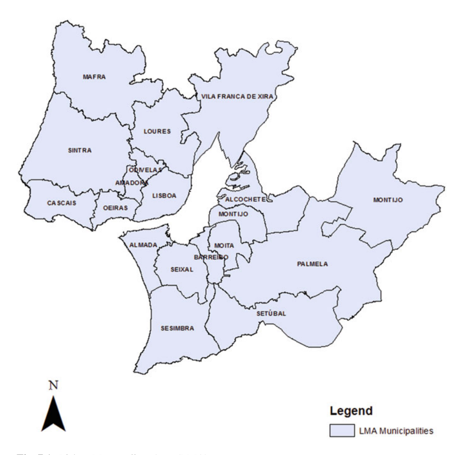
Fig. 7.1 Lisbon Metropolitan Area (LMA)

the 1960', with flows comings essentially from rural areas, the immigration dynamic of the 1970s and the 1980s is mainly related to the population of the ex-Portuguese colonies, which occupied the first peripheral crown of Lisbon. According to a recent characterisation of LMA with planning purposes (Regional Coordination Commission of Lisbon and Tagus Valley [CCDR]), this is a polarised territorial entity with an influence that exceeds its administrative borders, explained by, and among other factors, the improvement of transport infrastructures (CCDR 2009: 33). LMA is the location of multinational enterprises and several industrial activities, especially in the South bank of Tagus River. It is the most competitive economic center of the country (38.6% of National GDP) (CML 2012) with global integration and a strong presence in international markets. This is also a territory with problems like the lack of land use planning, urban and landscape disqualification, mobility, environmental risks, social exclusion and inequality (Figs. 7.2 and 7.3).