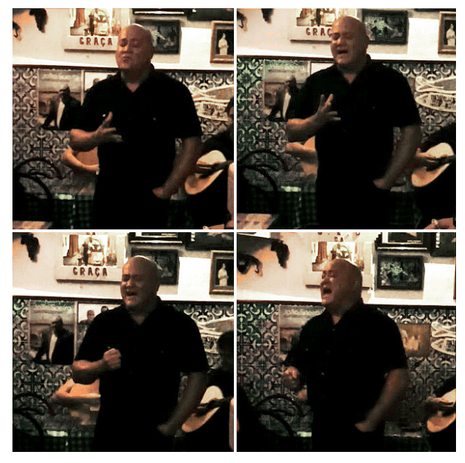
Fig. 5. The emotion of fado, Tasca do Jaime @Author, 2020.