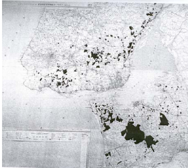
Figure 2: “Conjuntos Habitacionais Clandestinos na Região de Lisboa” (Eugen Bruno, 1984)

The location of the UAIG evidences relations with the space morphology and its proximity to the metropolis, there are already some studies that reveal the location of UAIG in the MLA (DGOTDU, 1996) (Rolo, 2005) (Raposo, 2009) (Gonçalves, Alves e Nunes da Silva, 2010).