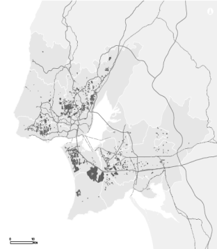
Figure 4: Mapping UAIG (Isabel Raposo, 2009)

Participation and the idea of collective are increasingly valuable in contemporary discourse and architectural practices (Arnstein, 1969) (Giancarlo de Carlo, 1970) (Habraken, 1972) (Hamdi, 1995, 1997, 2004, 2010) (Sanoff, 1990) (Spinizzi, 2005). Several experiences in the practice of urban requalification at the international level allow legitimizing the paradigm shift (BIG, Topotek1, Superflex, 2012) (Zuloark, 2010) (Ermacora, Bullivant, 2015). The publications on this intervention perspective have been multiplied, expressing the growing disciplinary interest in the field of architecture, especially in the requalification and transformation of informal settlements. There are several architects who value community participation in the strategy of intervening in public space, taking it as a point of spatial, social and cultural relations and identity and cohesion (Rosa, 2011, 2013, 2015) (Andreini, Casamonti, Giberti, 2012) (Jáuregui, 2010, 2012, 2013).