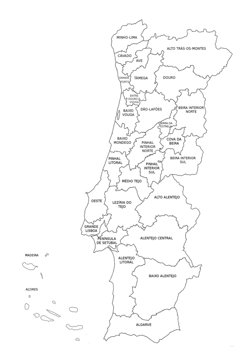
Figure A1 - Map of Portugal with NUTS III